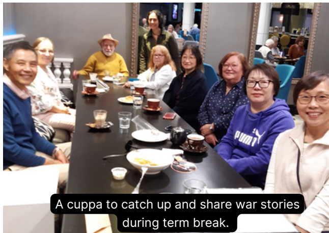
A cuppa to catch up and share war stories during term break.