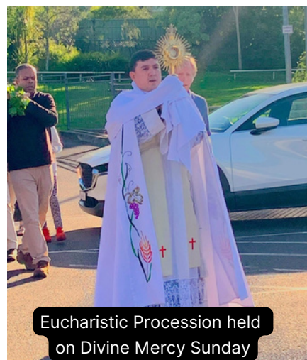
Eucharistic Procession held on Divine Mercy Sunday

Enrolment commences end of June Invitation to enquire now